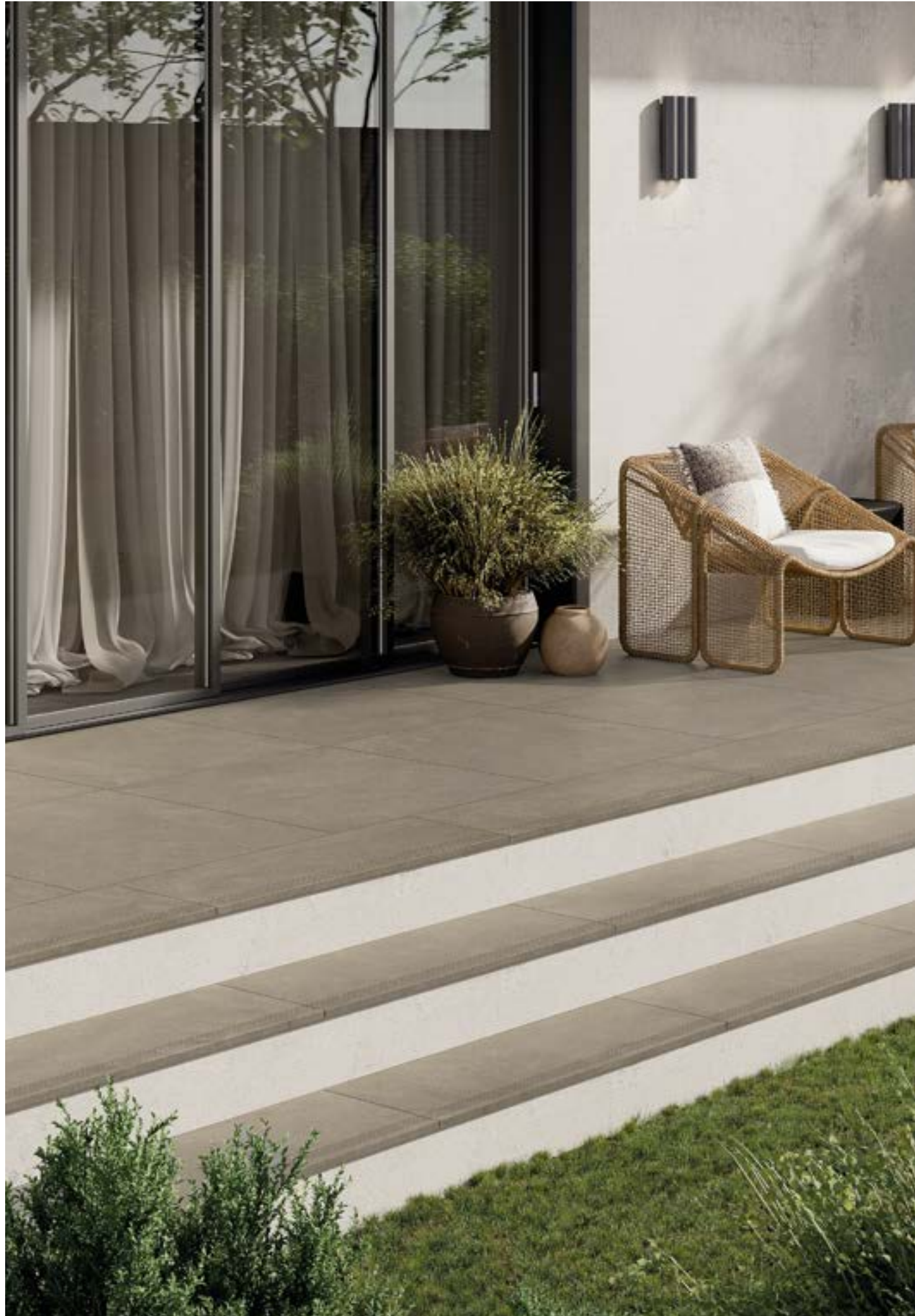
Collection: Dune | Colors: Amber, Shadow