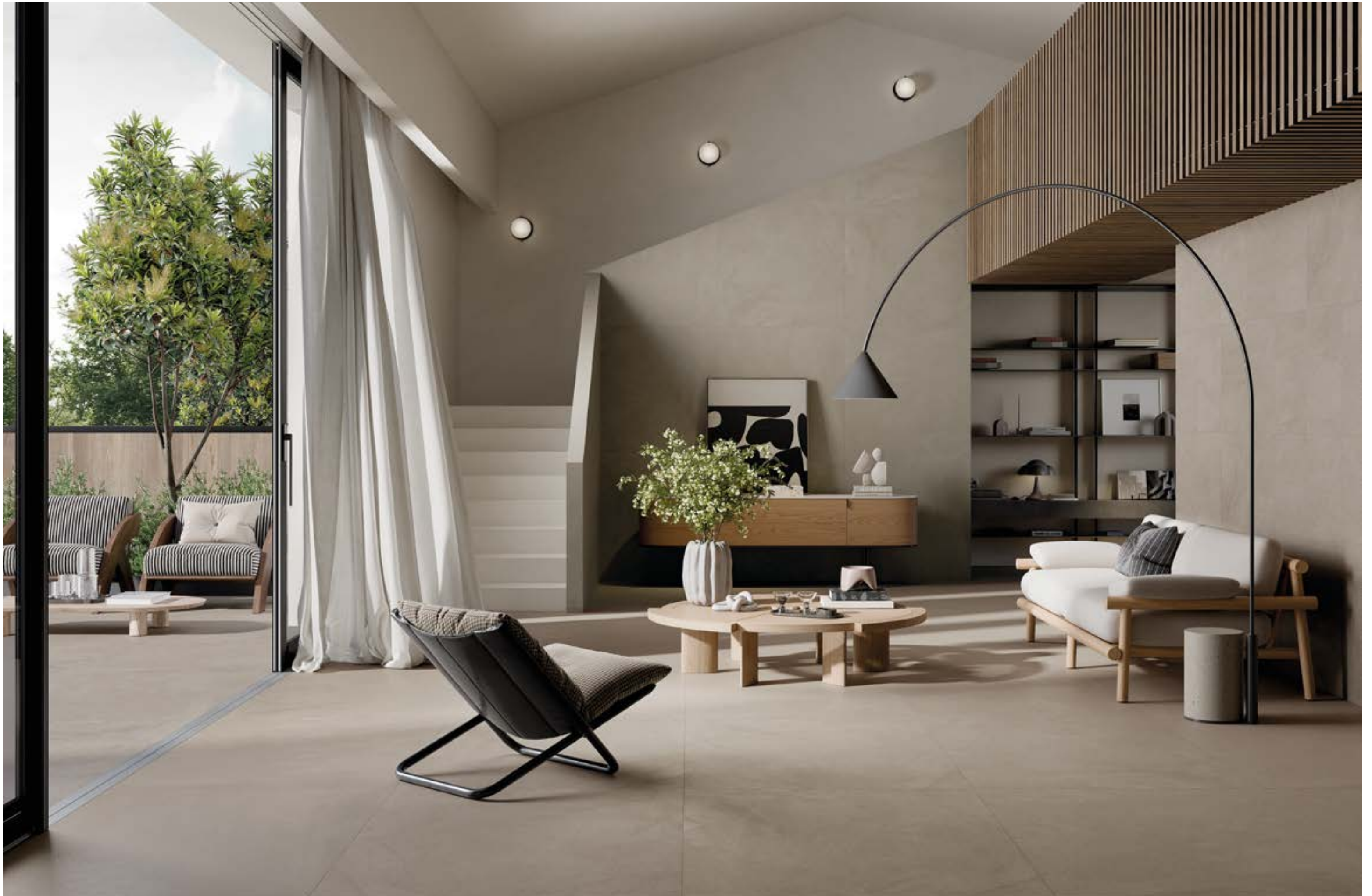
Collection: Dune | Color: Amber