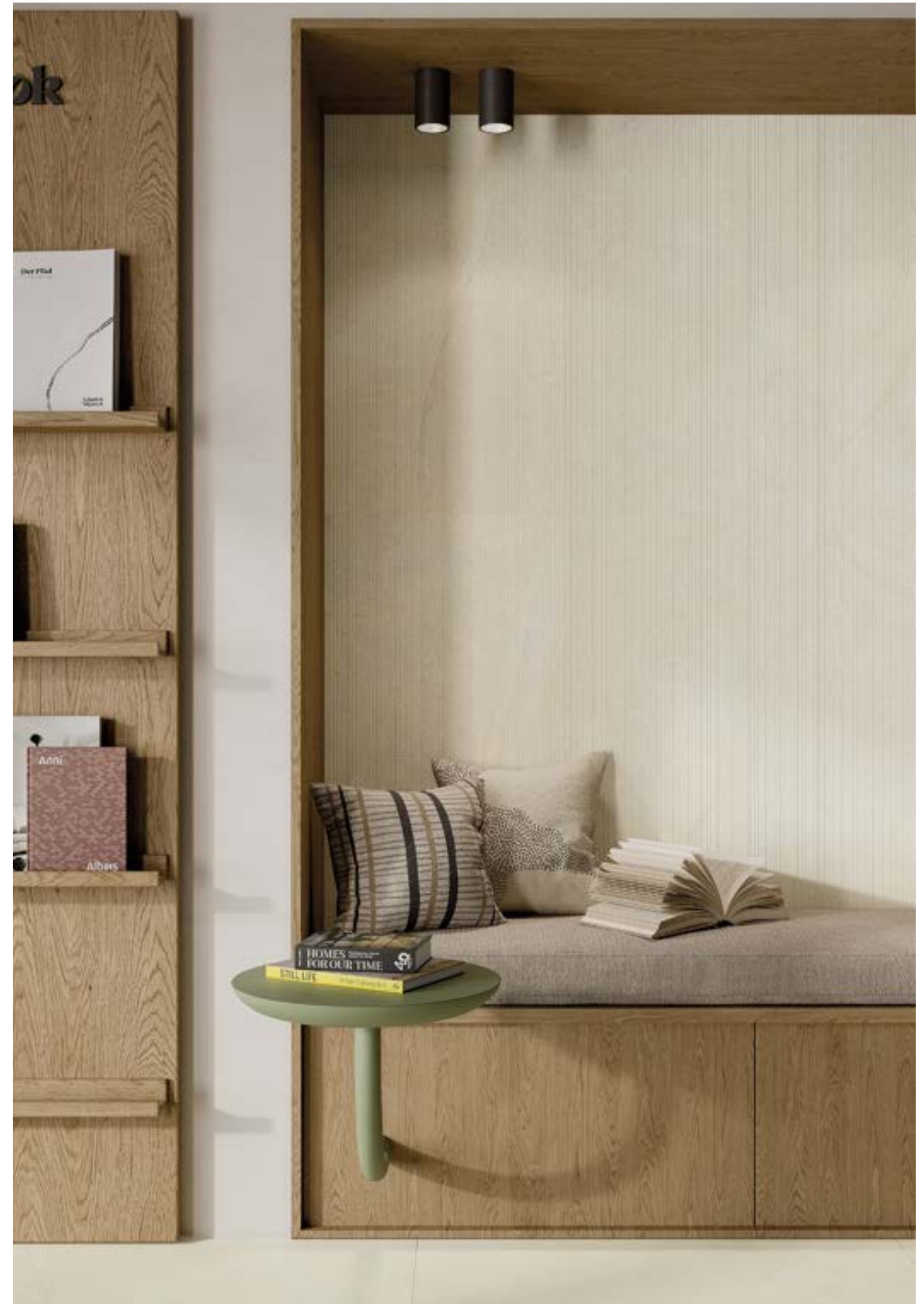
Collection: Dune | Color: Lime – Wave Decor