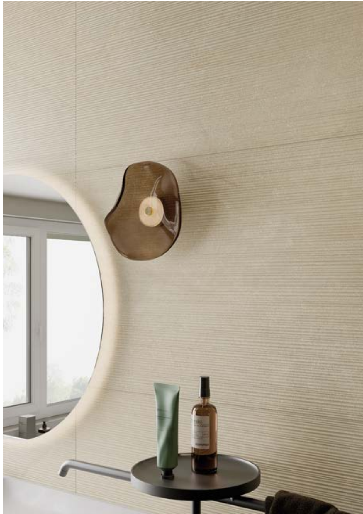
Collection: Dune | Color: Seashell – Wave Decor