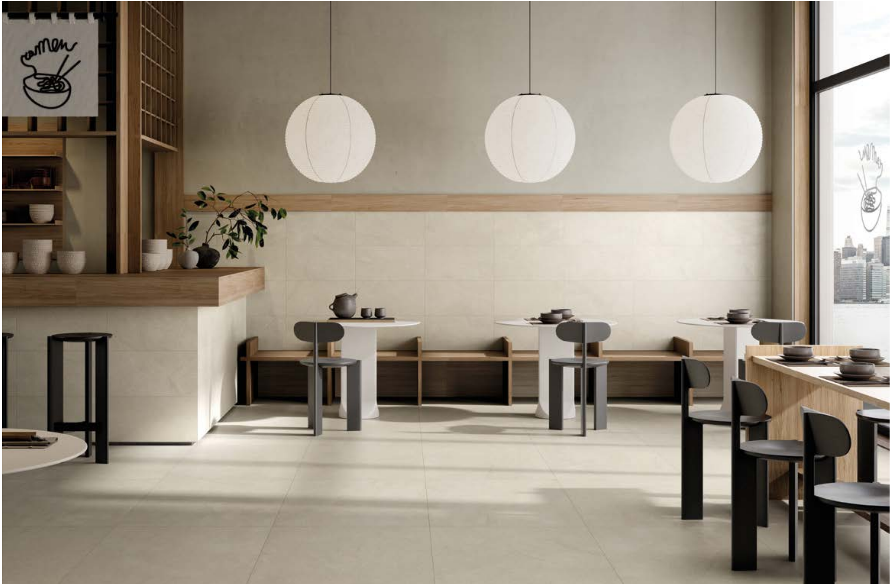
Collection: Dune | Color: Nebula