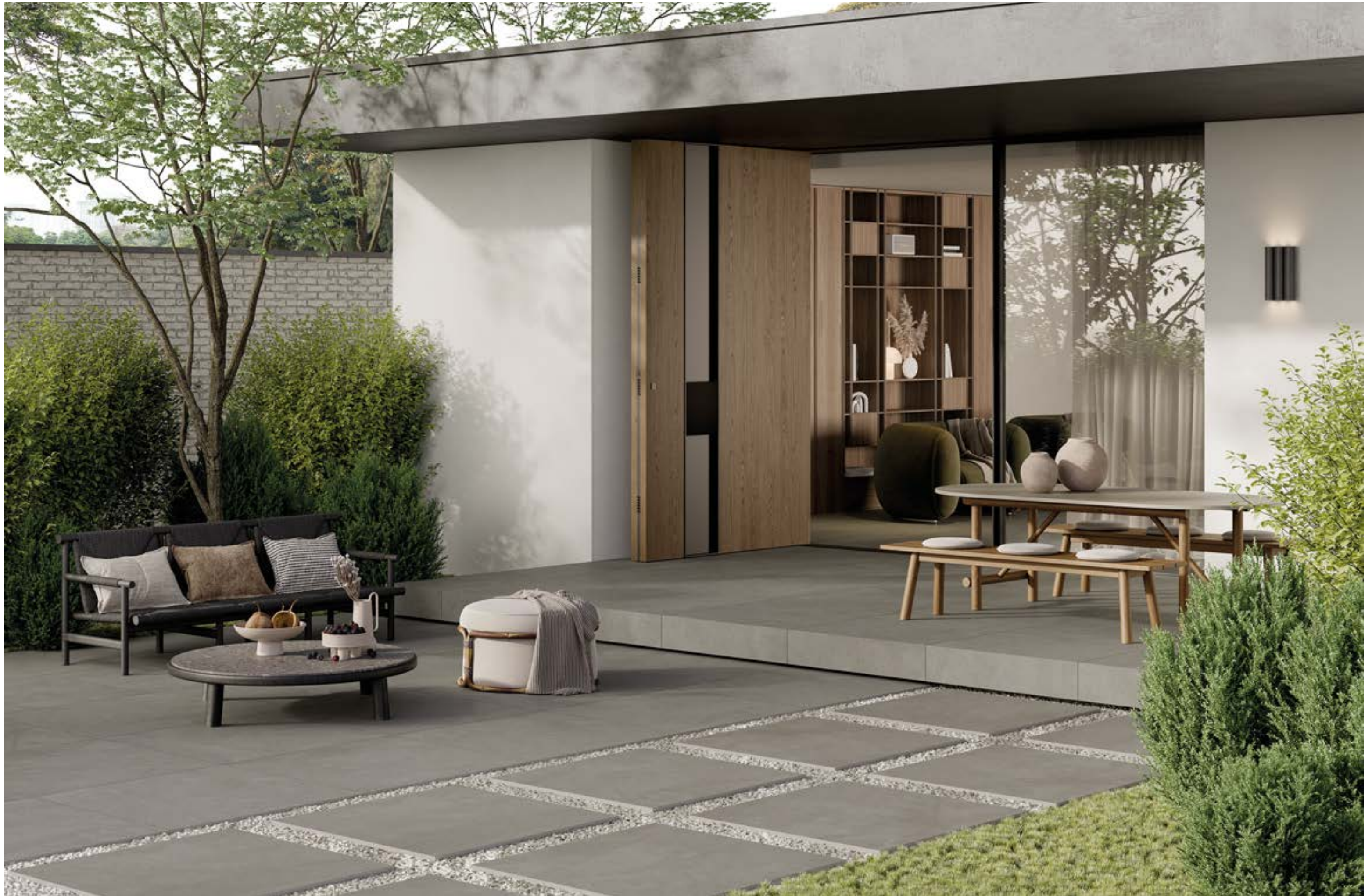
Collection: Dune | Color: Shadow