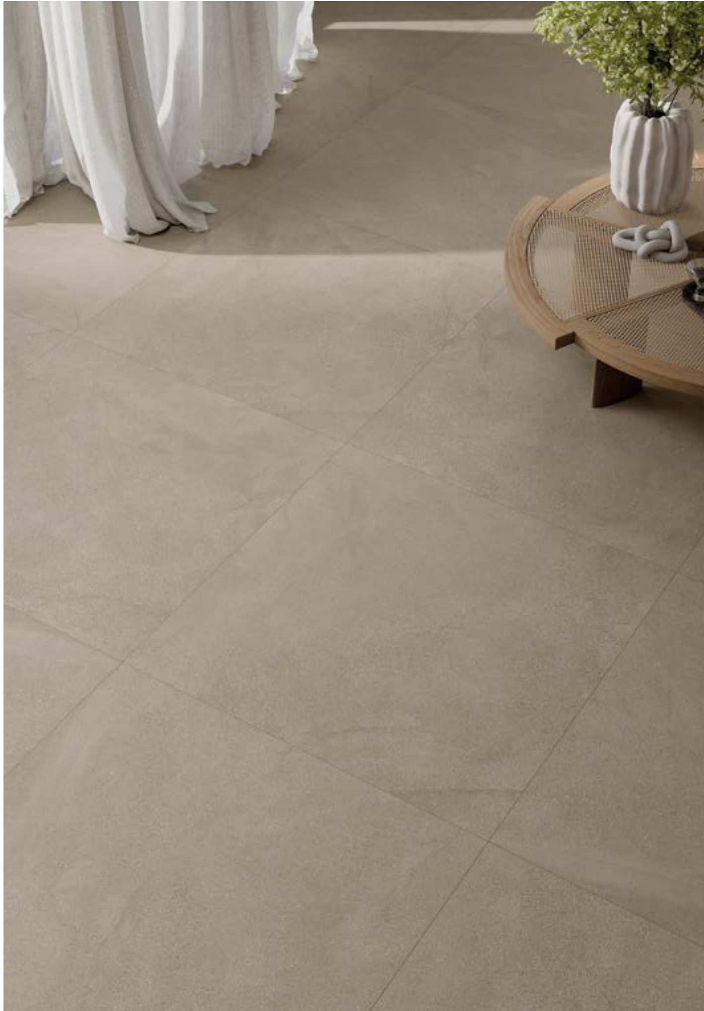
Collection: Dune | Color: Amber