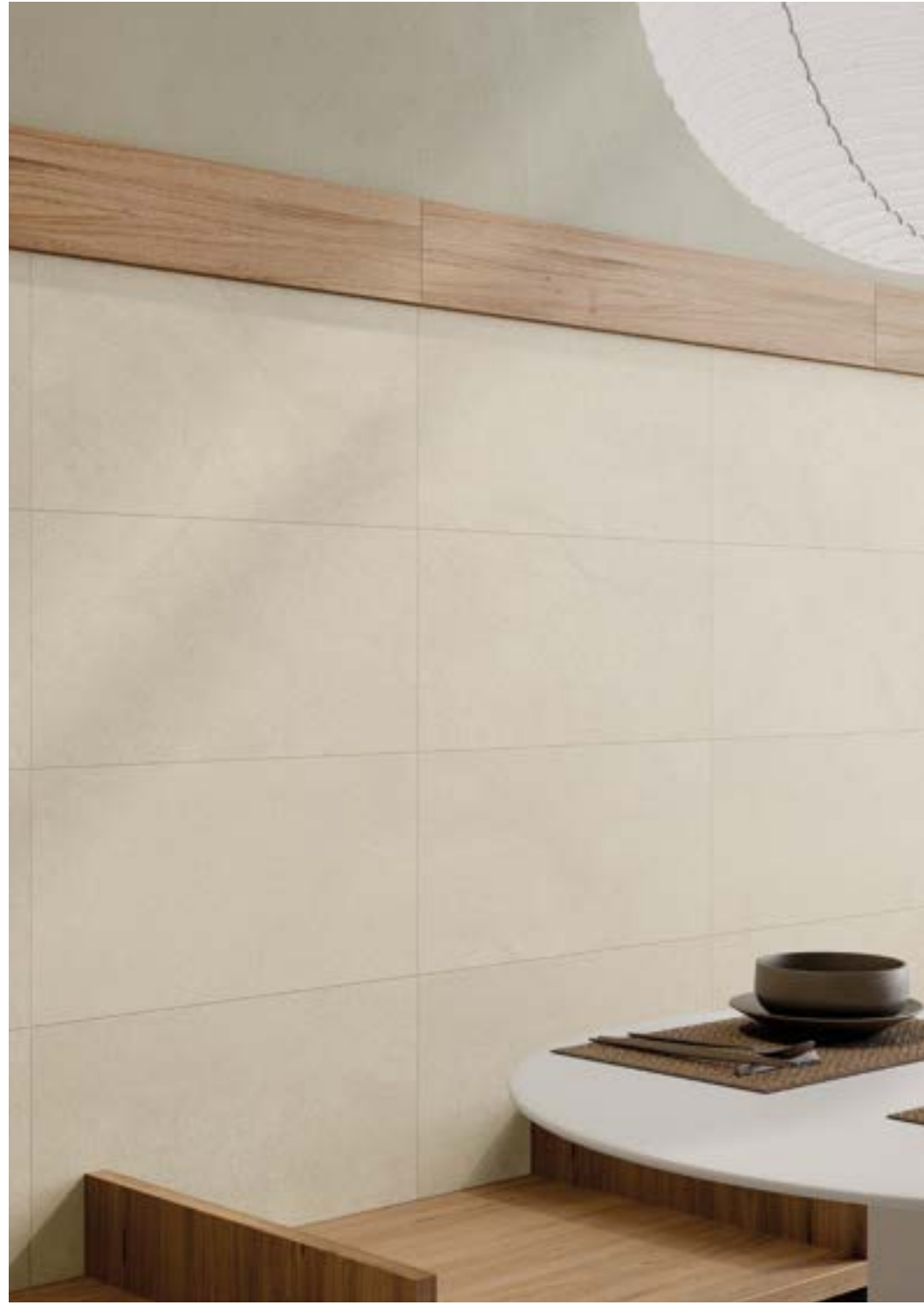
Collection: Dune | Color: Nebula