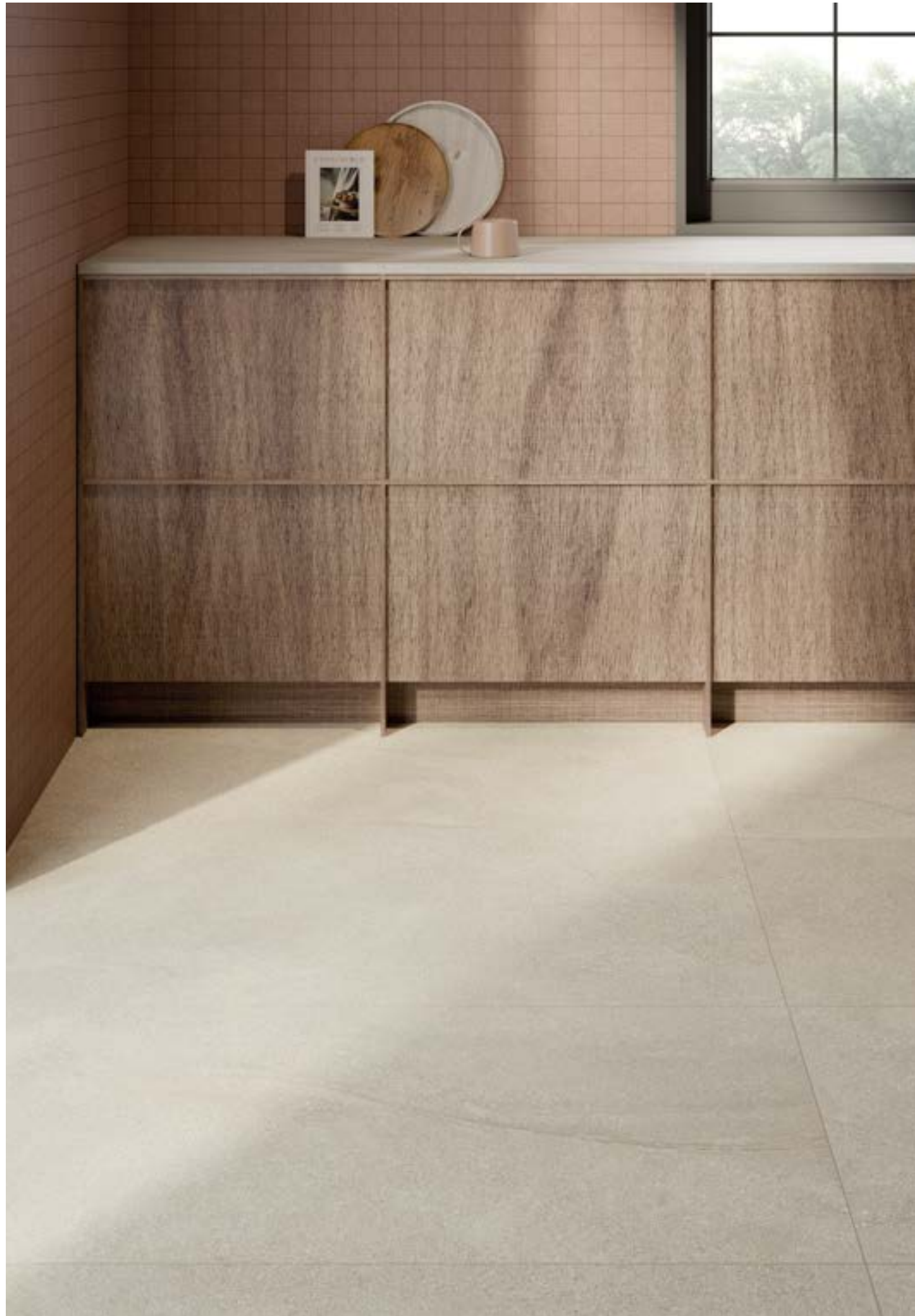
Collection: Dune | Color: Pearl Collection: Color Studio | Color: Malt