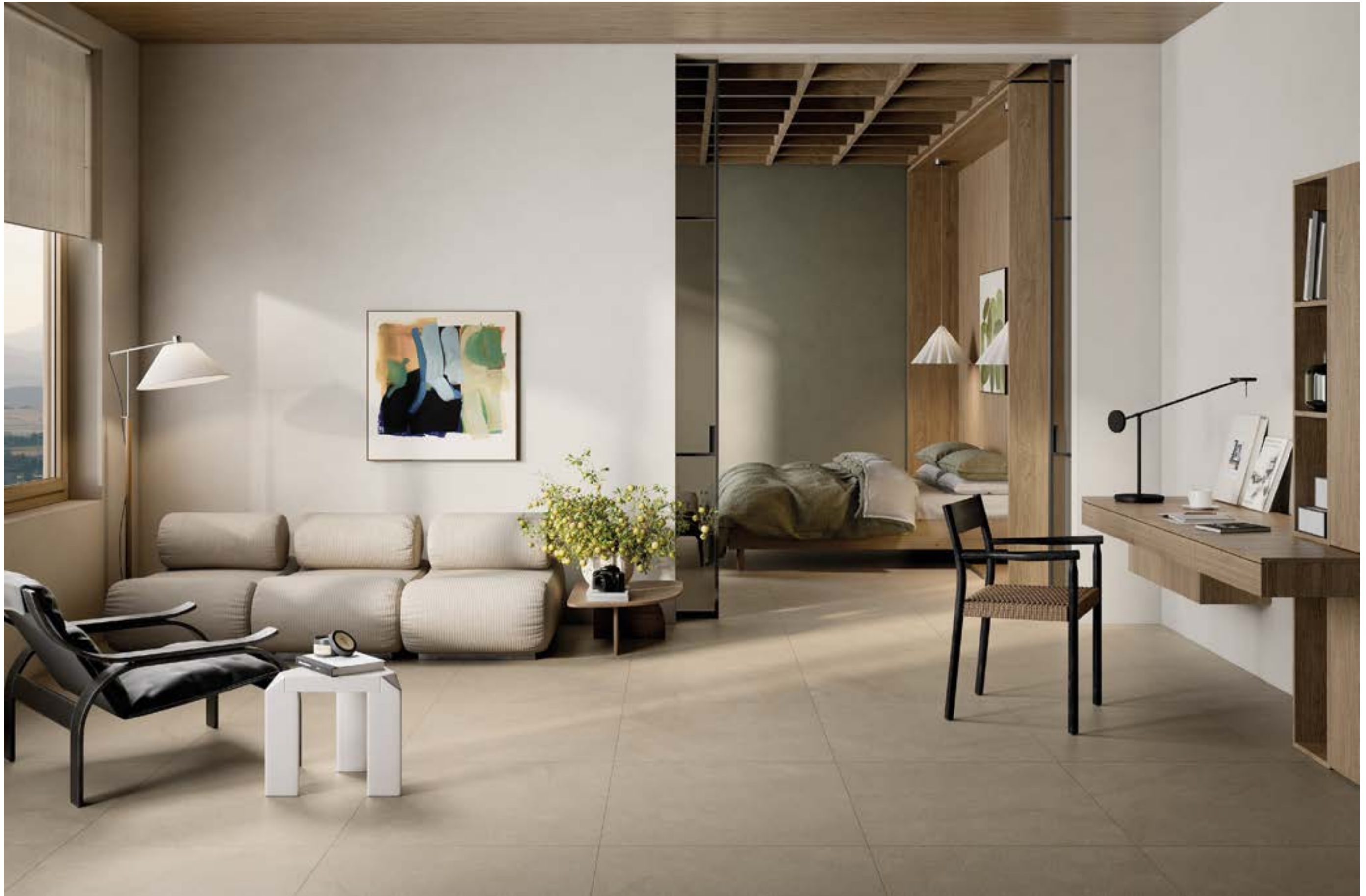
Collection: Dune | Color: Taupe