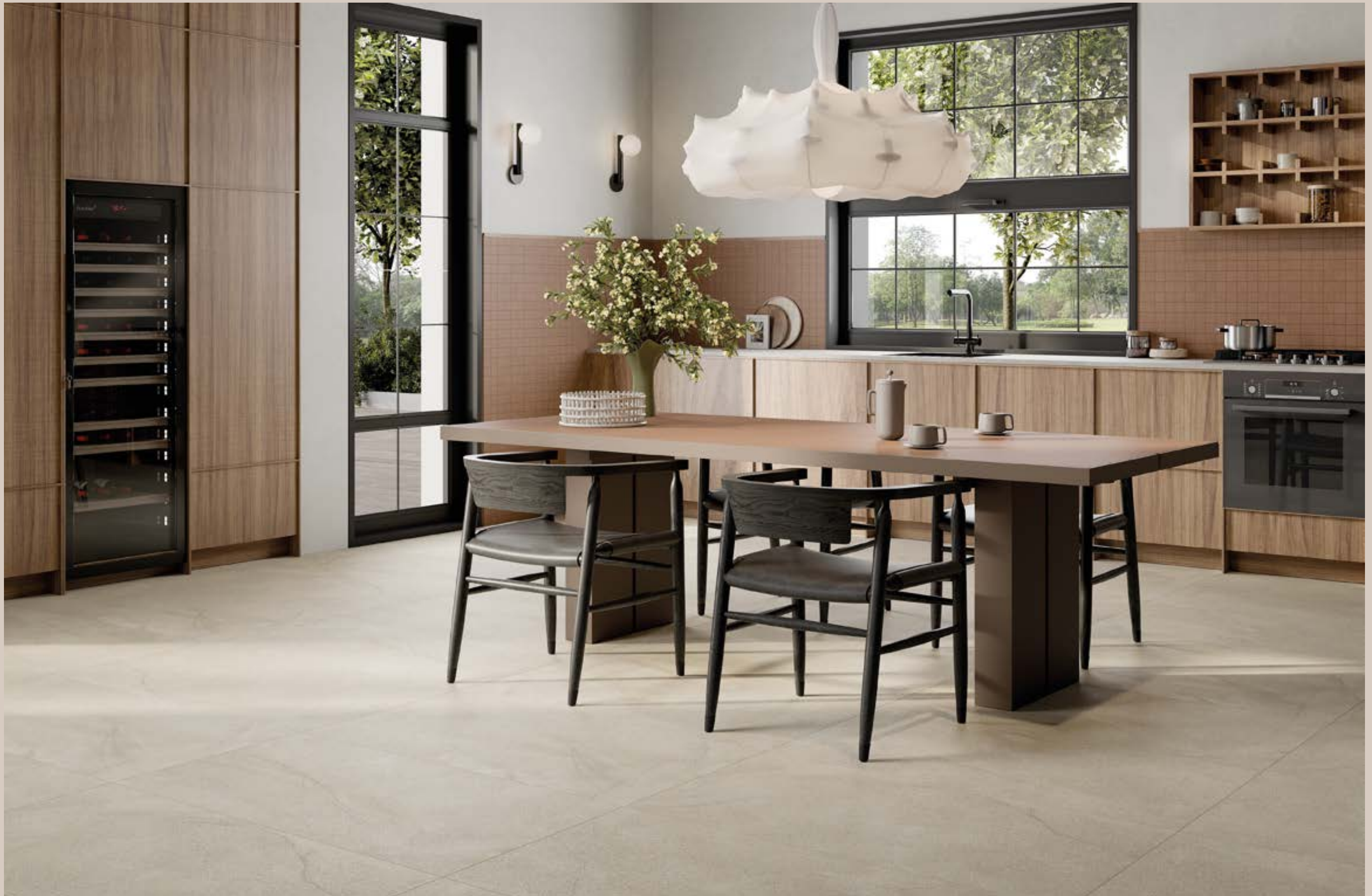
Collection: Dune | Color: Pearl Collection: Color Studio | Color: Malt