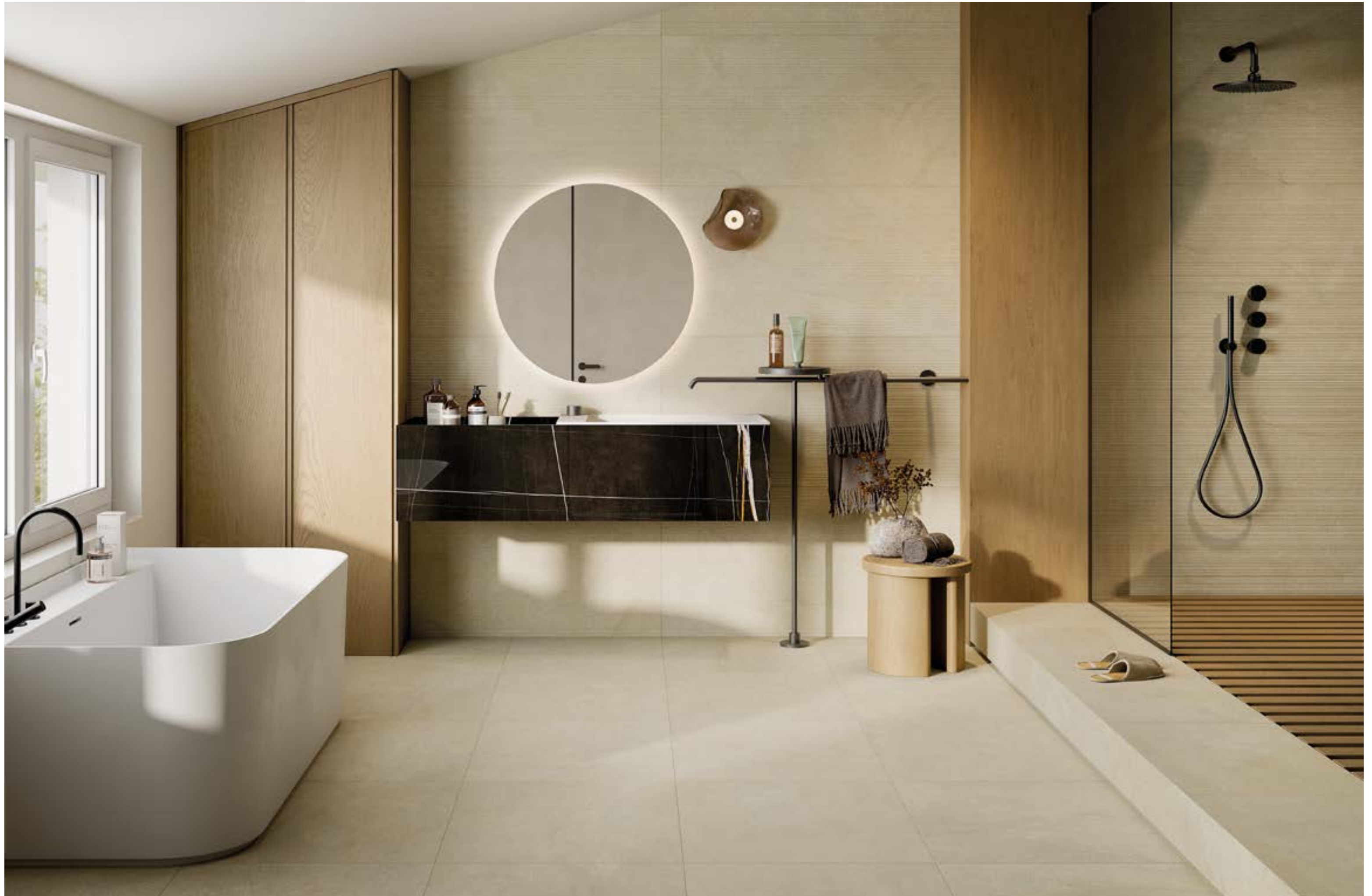
Collection: Dune | Color: Seashell Collection: Great Elite | Color: Elite Noir