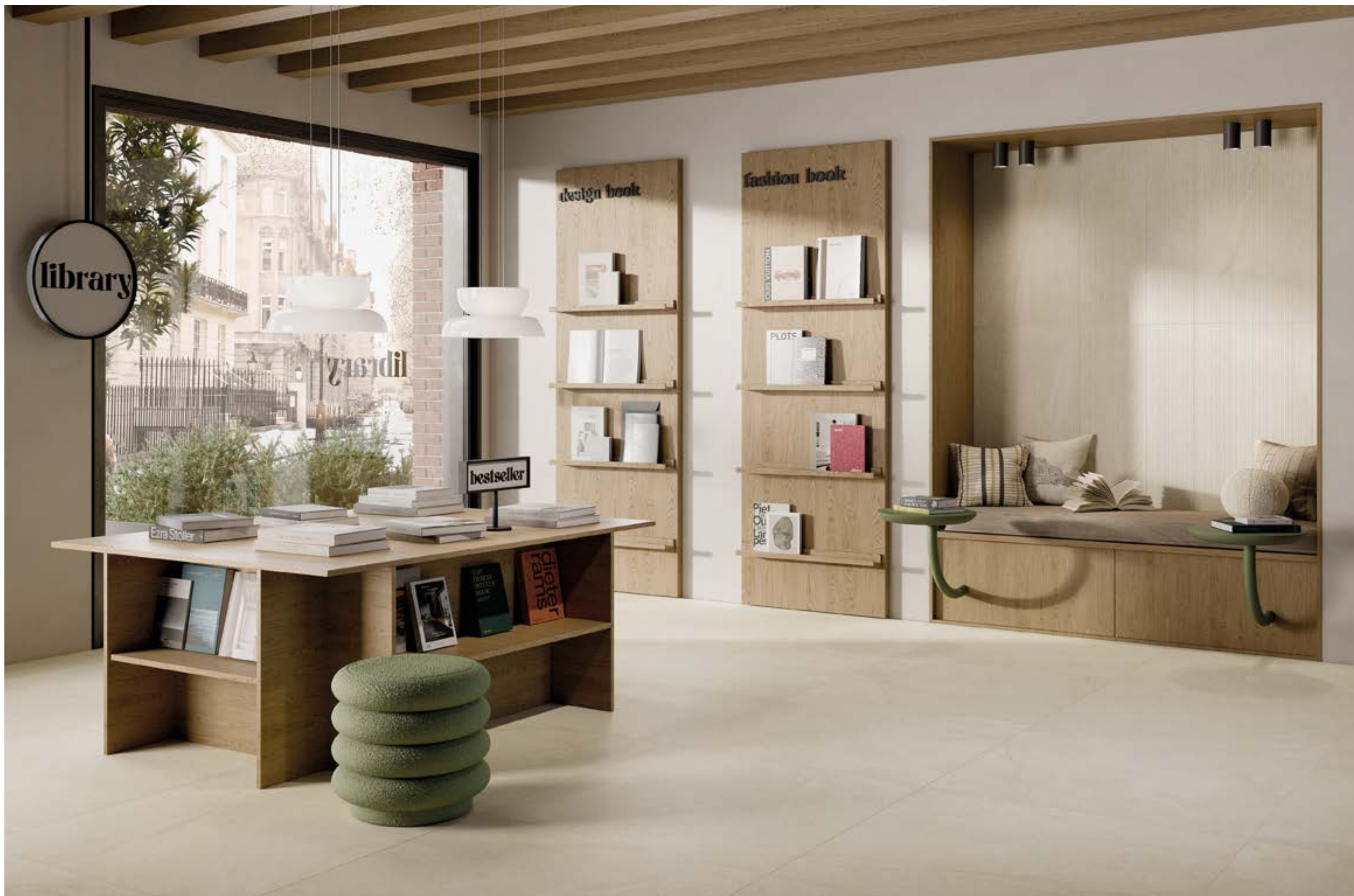
Collection: Dune | Color: Lime – Wave Decor