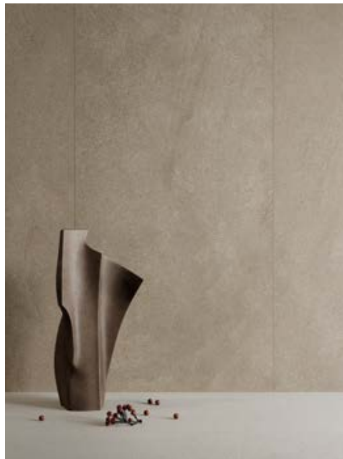
Collection: Dune | Color: Amber

A selection of porcelain slabs that generate a soft and serene atmosphere where time moves slowly, bringing forth a sense of natural beauty and tranquility.