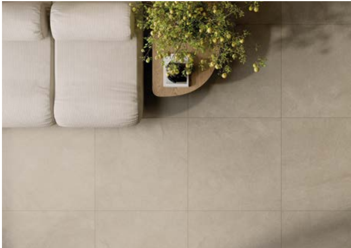
Collection: Dune | Color: Taupe